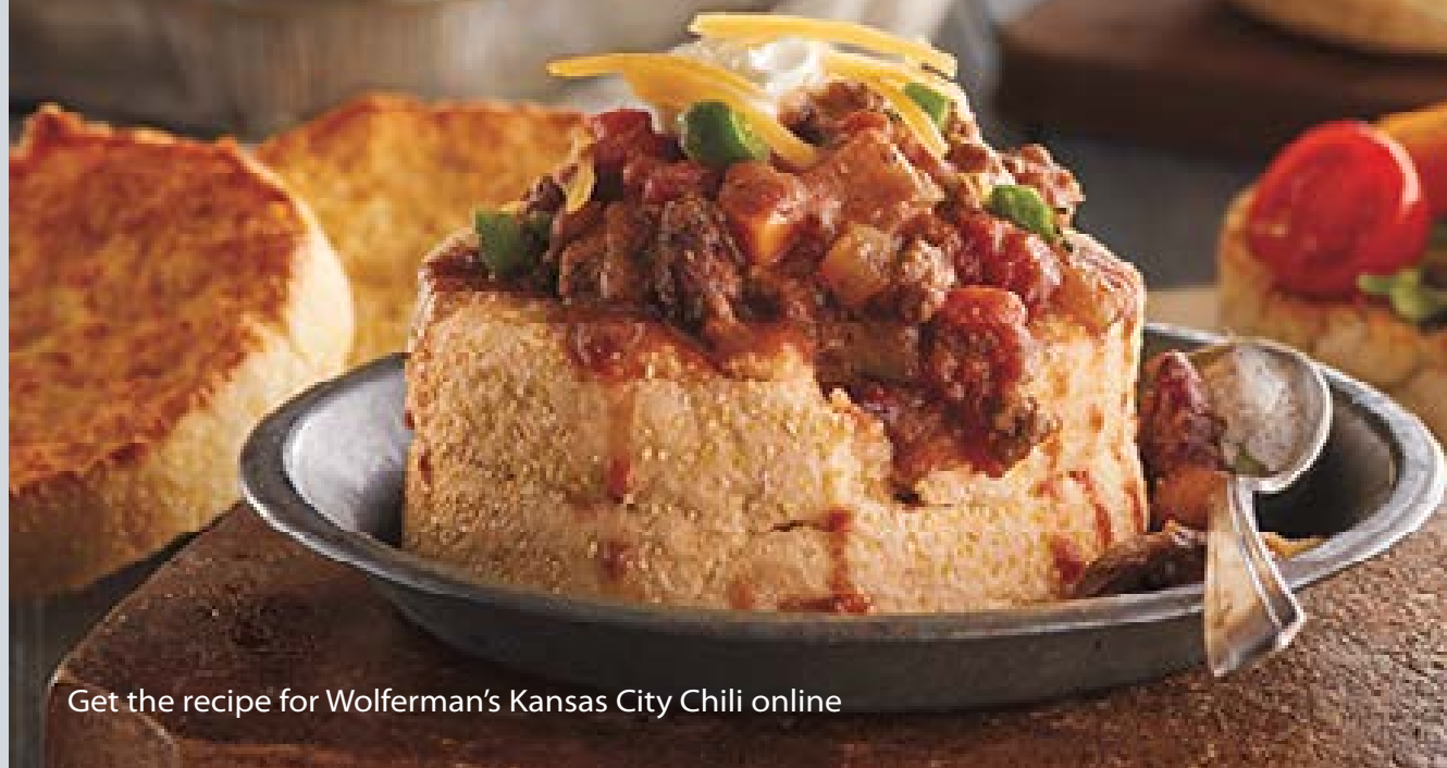
Get the recipe for Wolferman's Kansas City Chili online