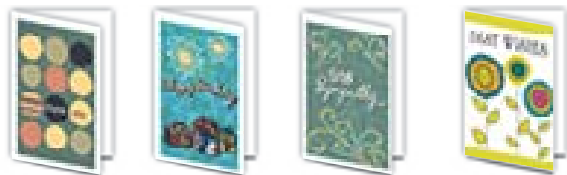
Thank You E60

Add a special touch to any gift with a personalized greeting card for $3.99. Select from below or browse our entire collection at Wolfermans.com/greetingcards